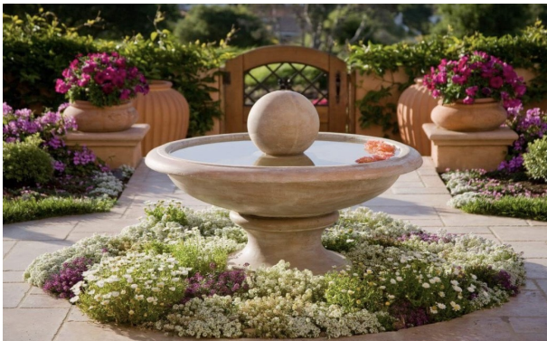
Pottery & Water Features