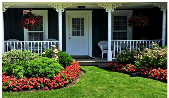
Shapes & Textures